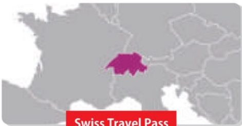
Swiss Travel Pass