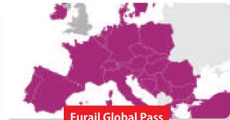
Eurail Global Pass