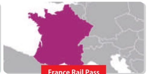
France Rail Pass